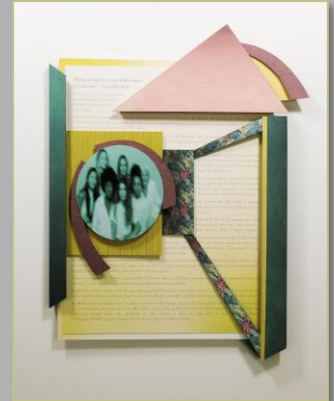
Not Your Mother's Sisterhood