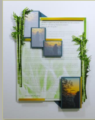
I Balance My Life In the Garden