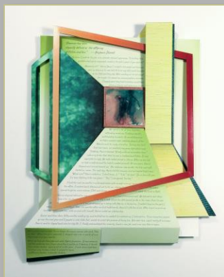
Fireworks and Roses