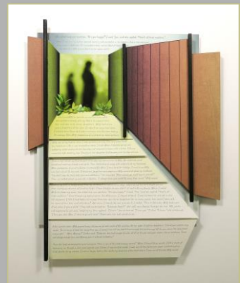
Like A Mother