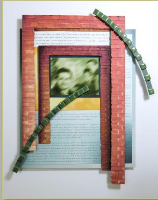
I Didn't Know You